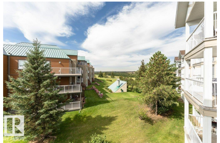
302-9930 100 Ave, Fort Saskatchewan, AB